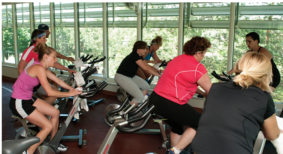
Vigorous exercise like this workout session on stationary bicycles is among the fitness options available under Lands' End's wellness program.

Due to steady medical inflation, Sorenson said an organization that otherwise would face a 7.5% annual premium increase might in reality see an increase of 4%, all thanks to its adoption of a robust and engaging wellness program. "A wellness program takes